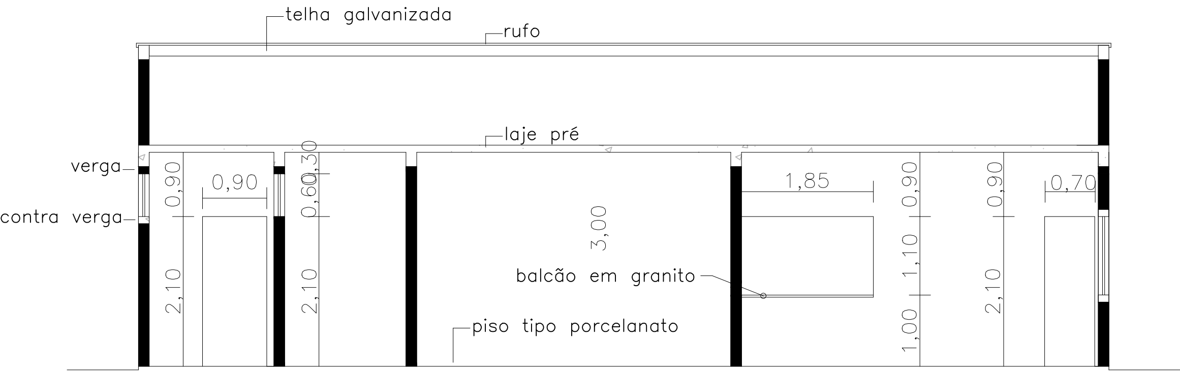
CORTE A B – ESC. 1:100